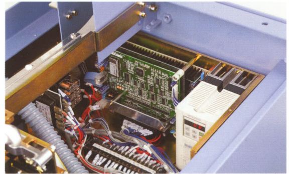
Low noise compact inverter for variable tension control.

100 φ LARGE SIZE CASTER help to move the machine smoothly.